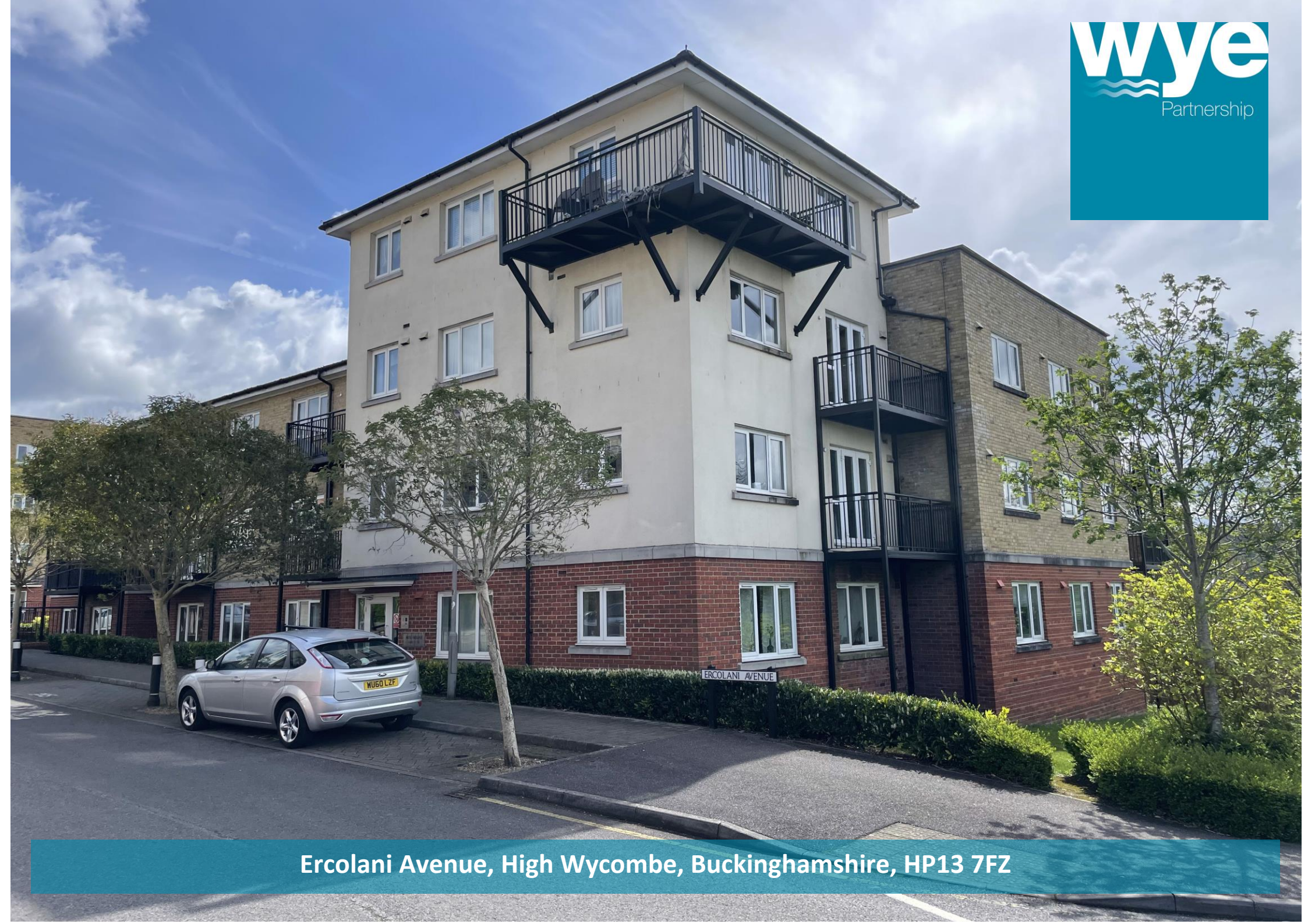
Ercolani Avenue, High Wycombe, Buckinghamshire, HP13 7FZ